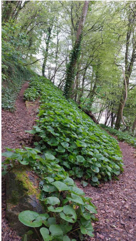
4 th May

As we finished the food we got to see the Babbacombe Beach near Hanbury's. The way down was a very adventurous path with a lot of exotic flowers and trees and many rocks. We were bit disappointed when we got to the beach because it was all rocky, but both the way down and up were brilliant because there were so many flowers and plants.